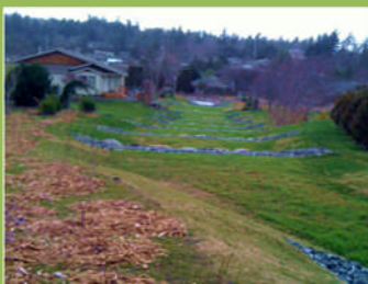
Silver Beach Creek Bioswale at Megan Lane