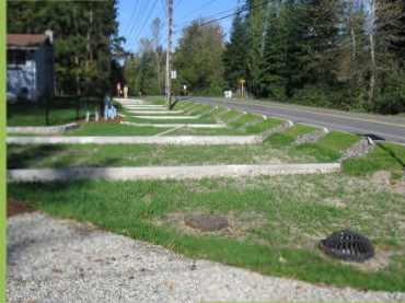
Lahti Drive Bioswale at Britton Rd.