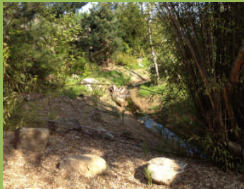
West Tributary Channel Restoration on Hillsdale Rd.